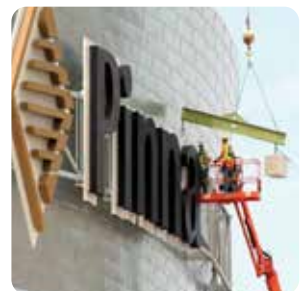
Signage / Signboard Industry