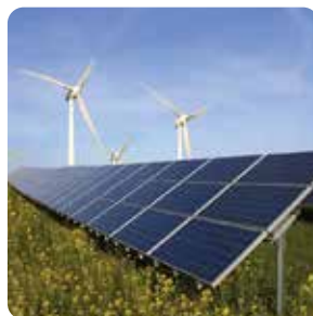
Renewable Energy Industry