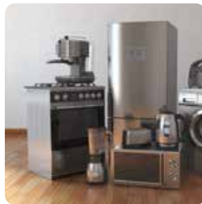
White Goods Industry