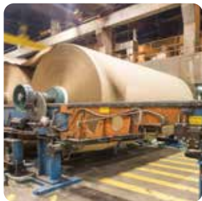
Paper Mill Industry