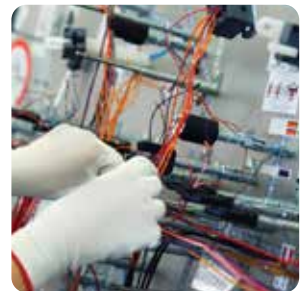
Wire Harness Industry