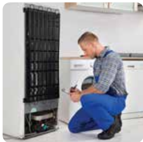
Insect Repellent Industry